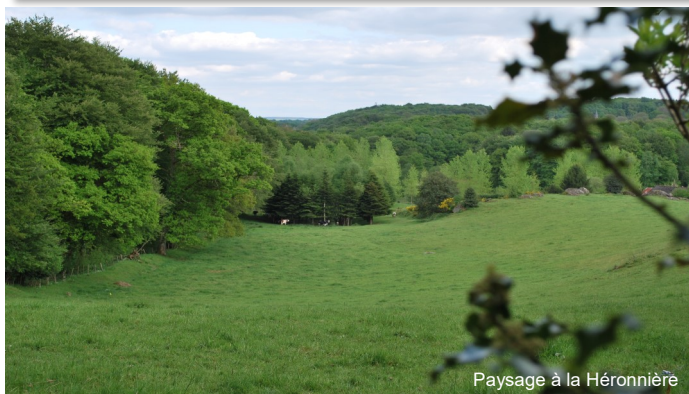
Paysage à la Héronnière

The two communes are built on a granite outcrop. The countryside is like that of all granite regions, very undulating.